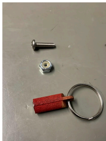
Machine screw, lock nut, and magnet