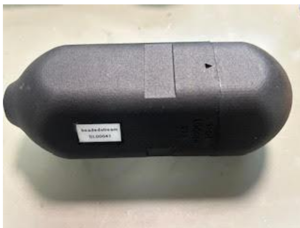
Closed and fully assembled spot logger